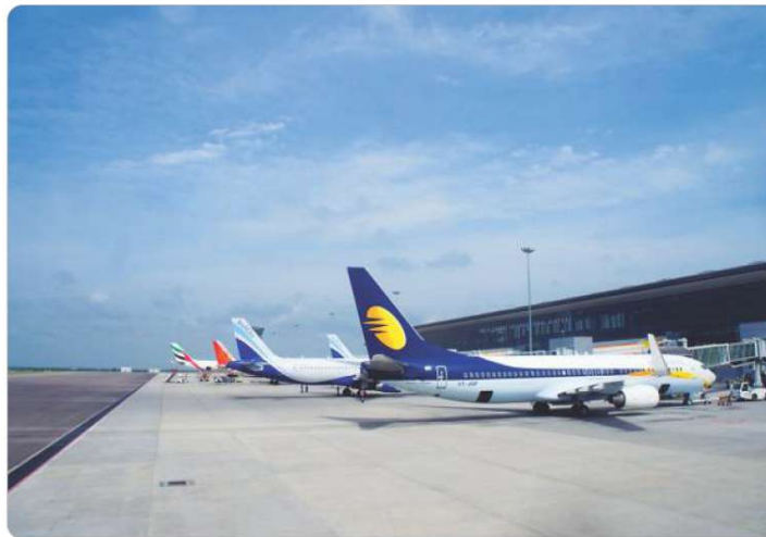
Rajiv Gandhi International Airport 30 Mints Drive