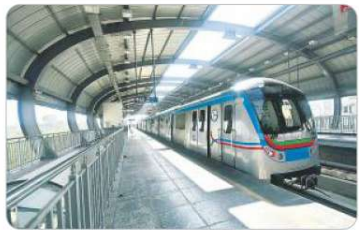
Metro Rail, LB Nagar

LB Nagar Circle, Metro Hub : 1.5 kms | Kamineni Hospital: 2 kms | TNR Preston Mall: 2 kms | Sagar Ring Road: 1 km