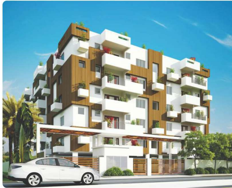
Super Homes Sun Shine @ Khairathabad