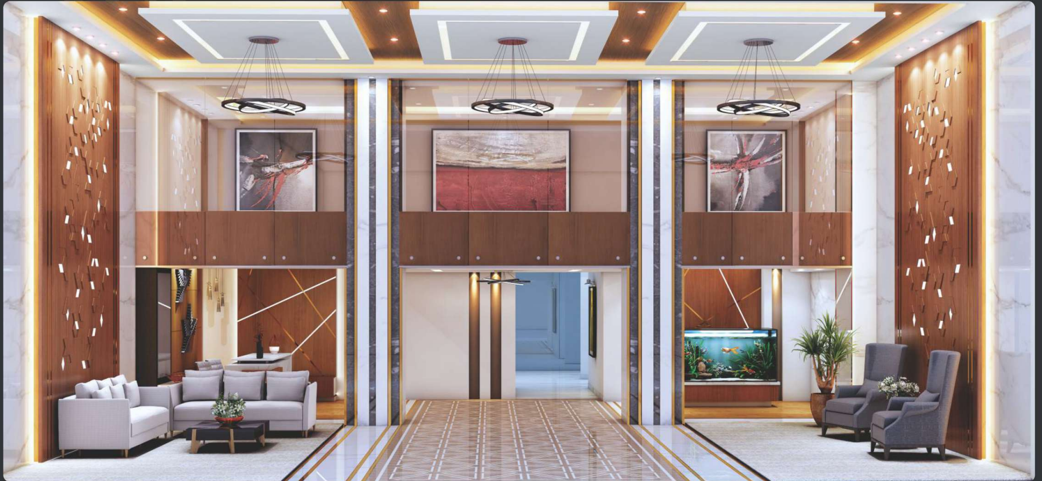
Double Height Entrance Lobby

With luxury within and conveniences around Abhirama Super Homes is all about Happy Living