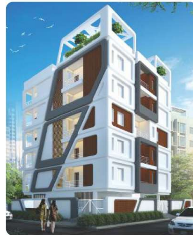
Super Homes Ram Residency @ Snehapuri Colony LB Nagar