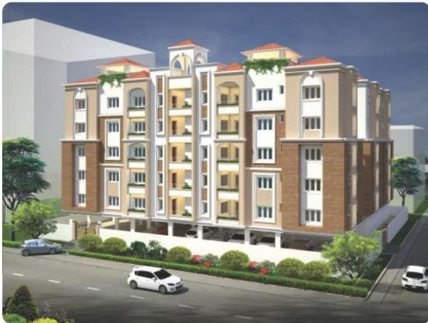
Namitha Palace @ LB Nagar