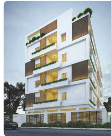
Super Homes Madhuram @ Champapet