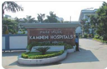
Kamineni Hospital, LB Nagar