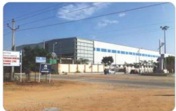
Adibatla SEZ 15 Mints Drive