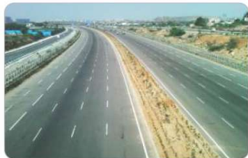
Outer Ring Road 15 Mints Drive