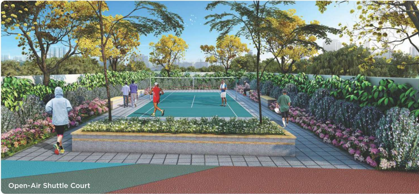
Open-Air Shuttle Court