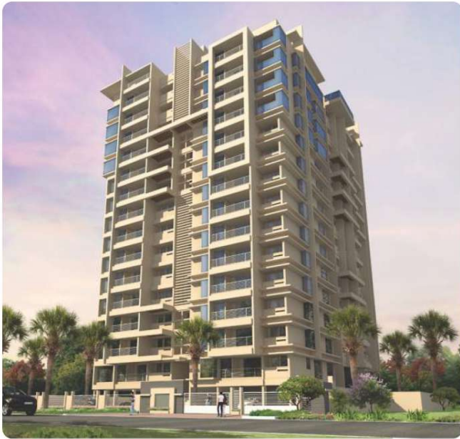
Namitha Everest @ LB Nagar